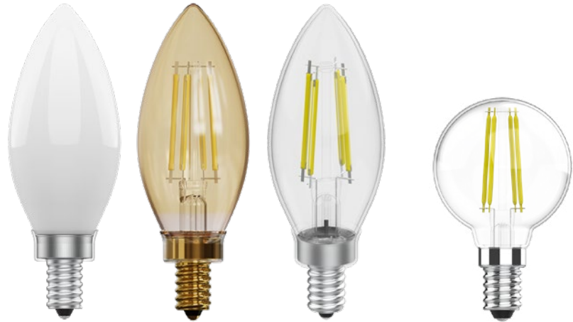
B10 Milky White

Operating temperature range -25 °C ~ +45 °C